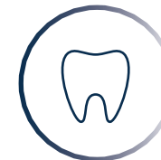
Oral / Maxillofacial